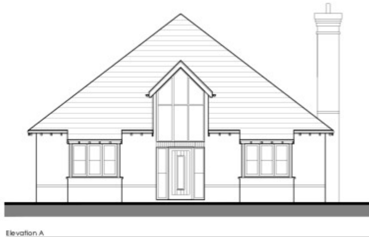
Proposed Elevations 006P3

APPLICATION: TM/21/03372/FL VALIDATED: 29 December 2021 This was approved in accordance with the following submitted details: Site Plan 002 P1 Existing received 29.12.2021, Site Plan 003 P3 Proposed received 29.12.2021, Proposed Floor Plans 004 P3 received 29.12.2021, , Proposed Elevations 006 P3 received 29.12.2021,